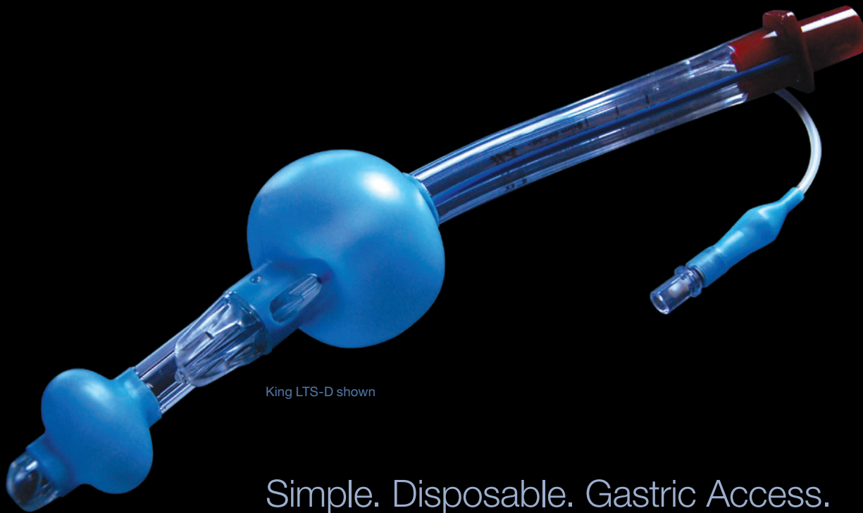
King LTS-D shown