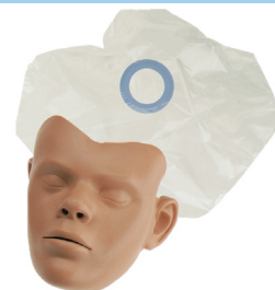
Unique Ambu Hygienic System